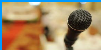
Candidate Z in 2016 High School, Social Studies