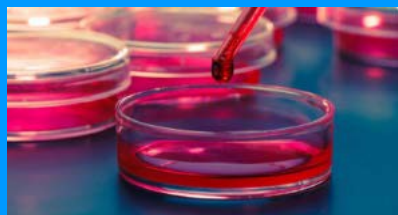
What's the Diagnosis?