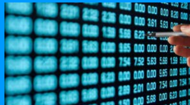
We've Got a Problem